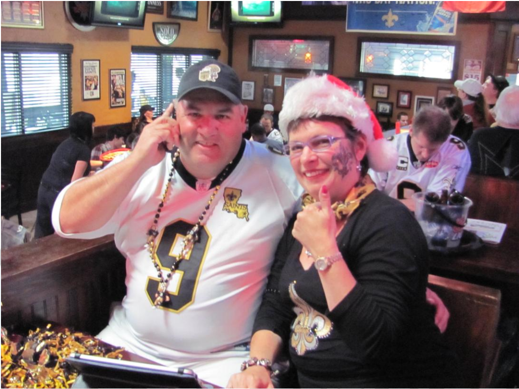
“...And be sure to call all of your relatives on Christmas!” – Rudy D & The Bev