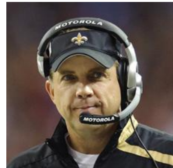
"Everyone is doing their job, especially the Fans!" – Coach