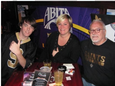
"I'll be there SaintsGuy and I'm wearing my lucky outfit!" - Pajama Boy