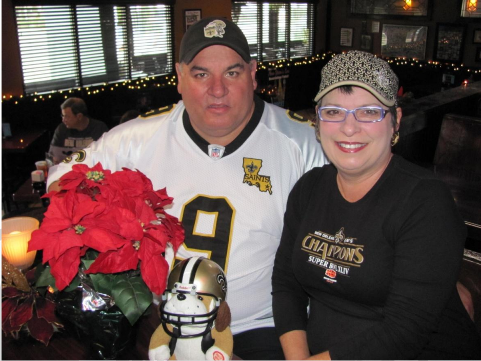
The Rudy & The Bev